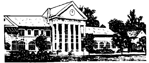
ELKS NATIONAL HOME

facility the next time you are in Tucson. Street address: 1800 North Oracle Road.