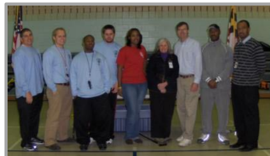
Community Service Department Volunteers