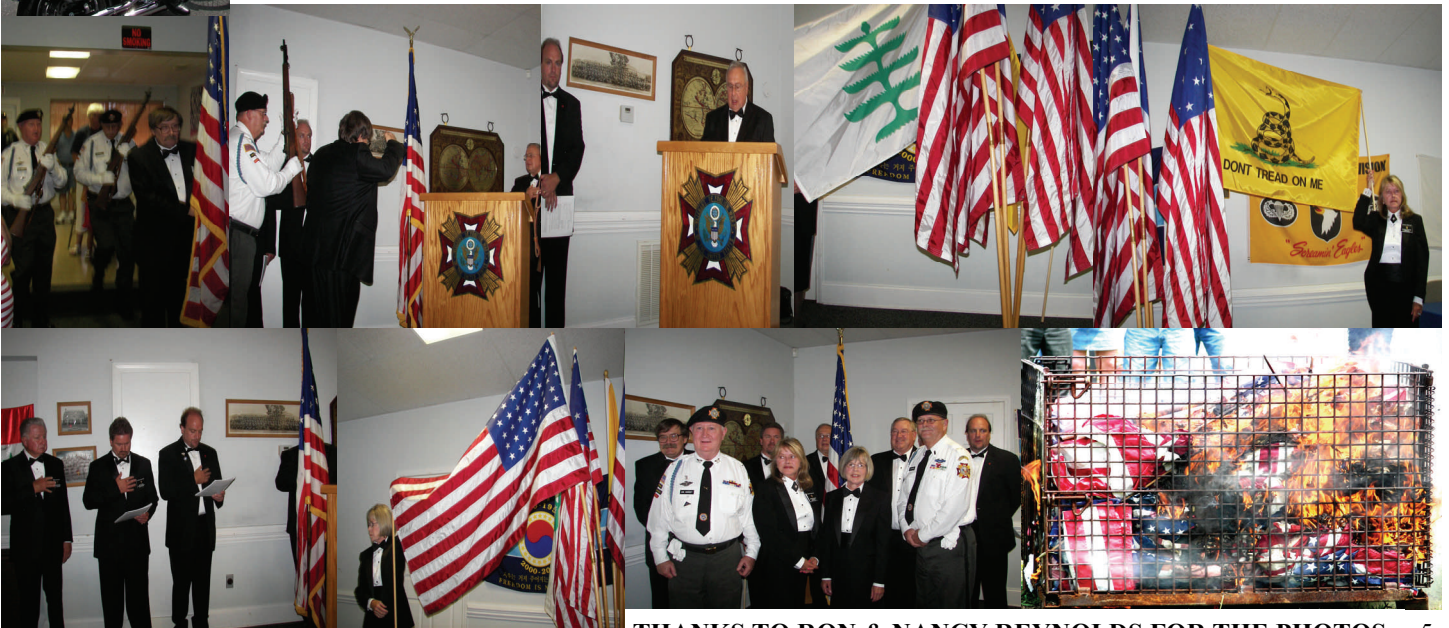
5