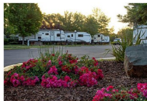
Feather Falls, Oroville, CA Casino, Kids Play Area, Dog Park, Local sites. April 30 - May 4