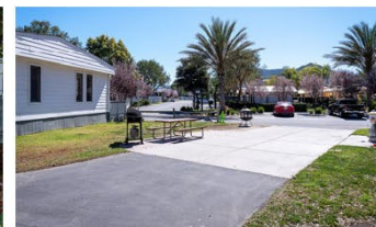
Solvang/Flying Flags, CA Pool, Bocce, Pet Park, Local sites, Avila Beach, Wineries May 12 - May 19