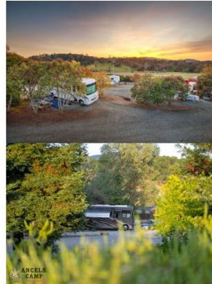
Angels Camp RV Park, Angels Camp, CA Pool, fire pits, dog park, playground, sand volleyball, horseshoes, kitchen pavilion, meeting room, laundry, propane, and WiFi. October 3 - 5

Come join the Trav'l'n Elks as we see fun and beautiful parts of our area. Contact our Trail Master, Debra Stiger at FANCYFORD59@YAHOO.COM for more information about these upcoming trips, and about other trips in the planning.