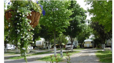
Heritage RV Park, Corning, CA Close to Sacramento River, local Casino, in town Wineries and Olive Oil distilleries, Pool, Pet walk, Clubhouse November 1 - 4