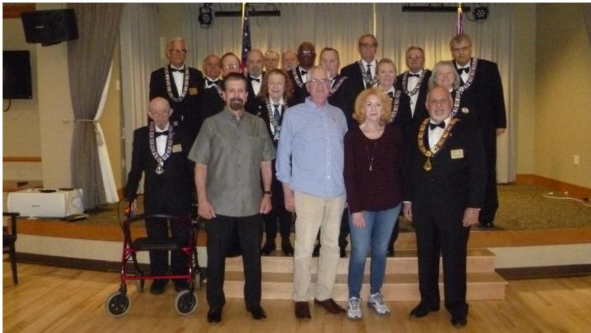
April's Initiation Class