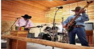
Runnin' for Cover Band