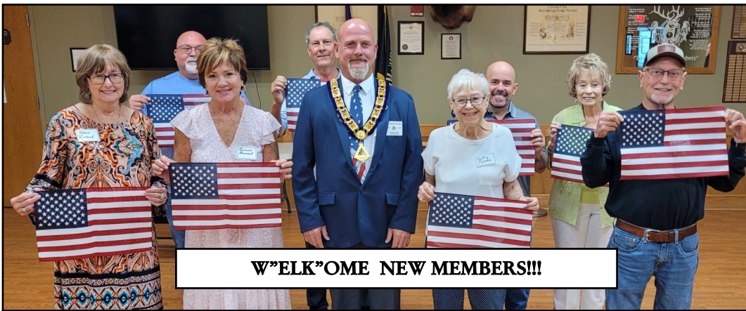
W"ELK"OME NEW MEMBERS!!!

Missouri Elks State Bass Tournament Saturday - October 12th