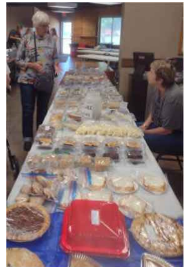
Bake Sale Continues to be Very Successful!