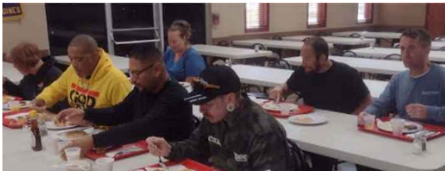
We salute our visiting Veterans from the Des Moines VA. Thanking them for their service and sacrifice.