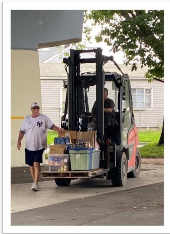
Street Soldiers Donations