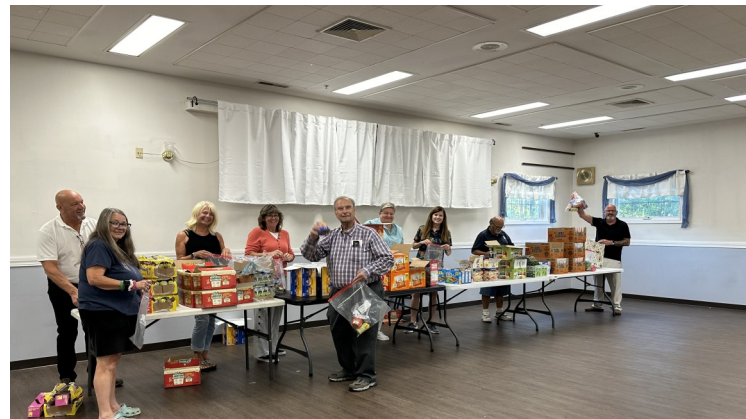
Volunteers came out to fill Weekend Food Bags for a Local School to help relieve Food insecurity. Monies are provided by the SPOTLIGHT GRANT. This is one of 3 rounds that we will be putting together for a total of 300 bags of food.. Thanks to all who made this happen!