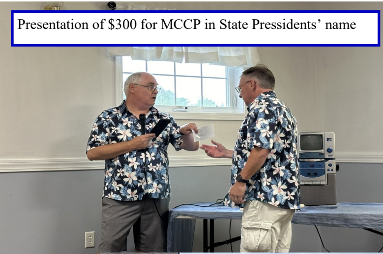
Presentation of $300 for MCCP in State Presidents' name