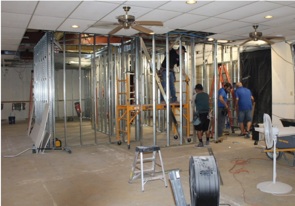
“Lodge Expansion Construction”

Part of the Lodge Expansion involves getting new “Bathrooms” in the Social Quarters. Pictured is the progress being made on this area of the Expansion.