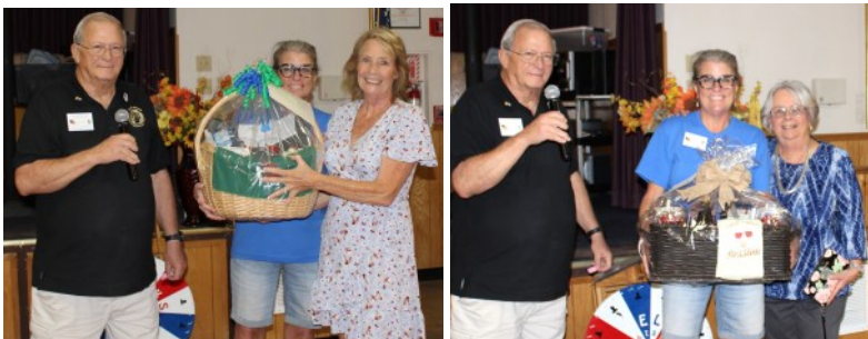
“Basket Raffle Winners”