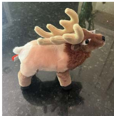
Elk Stuffed Animal $10.00

All proceeds are reinvested into the community