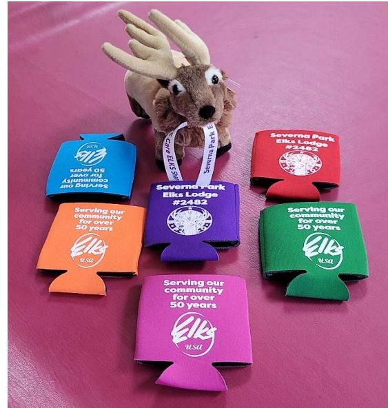
Elks Koozie $3.00