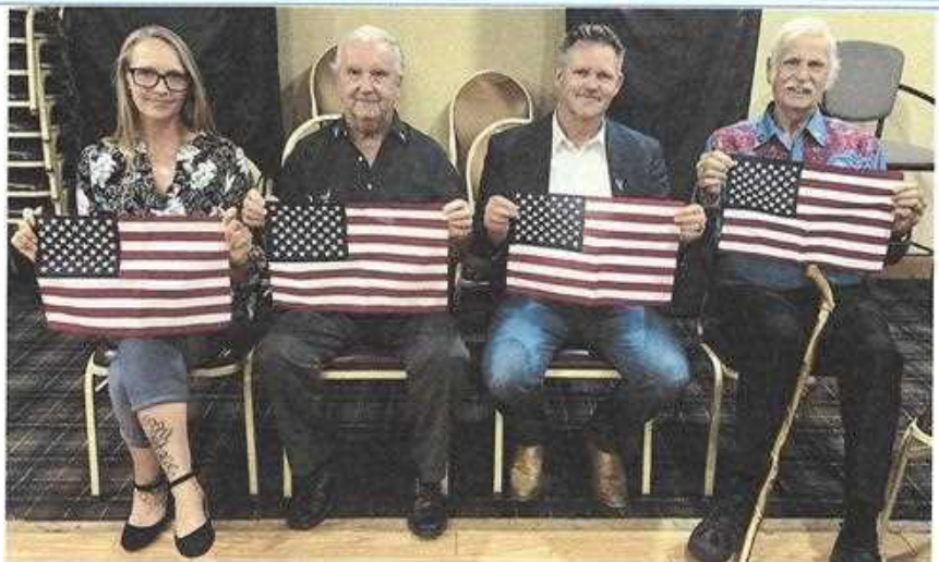
October new members