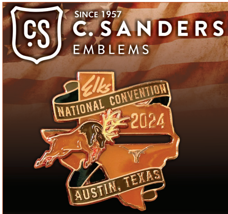
Convention Pin at Booth #314