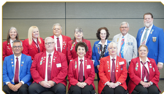
Second Place — Garden Grove, CA No. 1952 (96.4781)