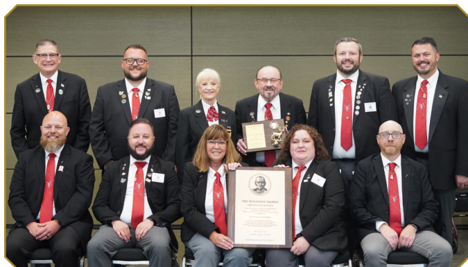
First Place — Kenton, OH No. 157 (96.5423)