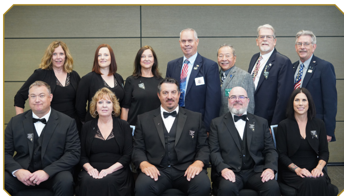
Third Place — Reno, NV No. 597 (94.9281)