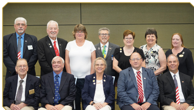
Fourth Place — Sanford, ME No. 1470 (94.6324)