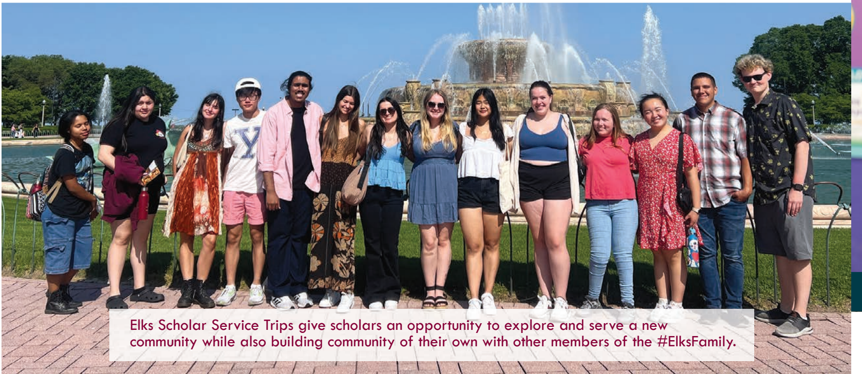
Elks Scholar Service Trips give scholars an opportunity to explore and serve a new community while also building community of their own with other members of the #ElksFamily.