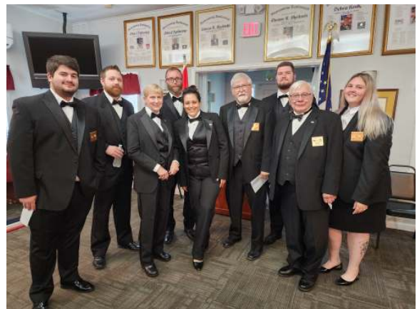
SG's Officers prepare to begin the ceremony.