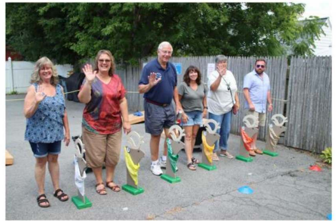
Clifton Park Elks #2466 | 695 MacElroy Rd | Ballston Lake, NY 12019 US