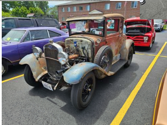
Scotia Glenville Elks in partner with the Village Special Events Committee sponsor The Fathers' Day car show ... 'Cruisin' on the Avenue.'